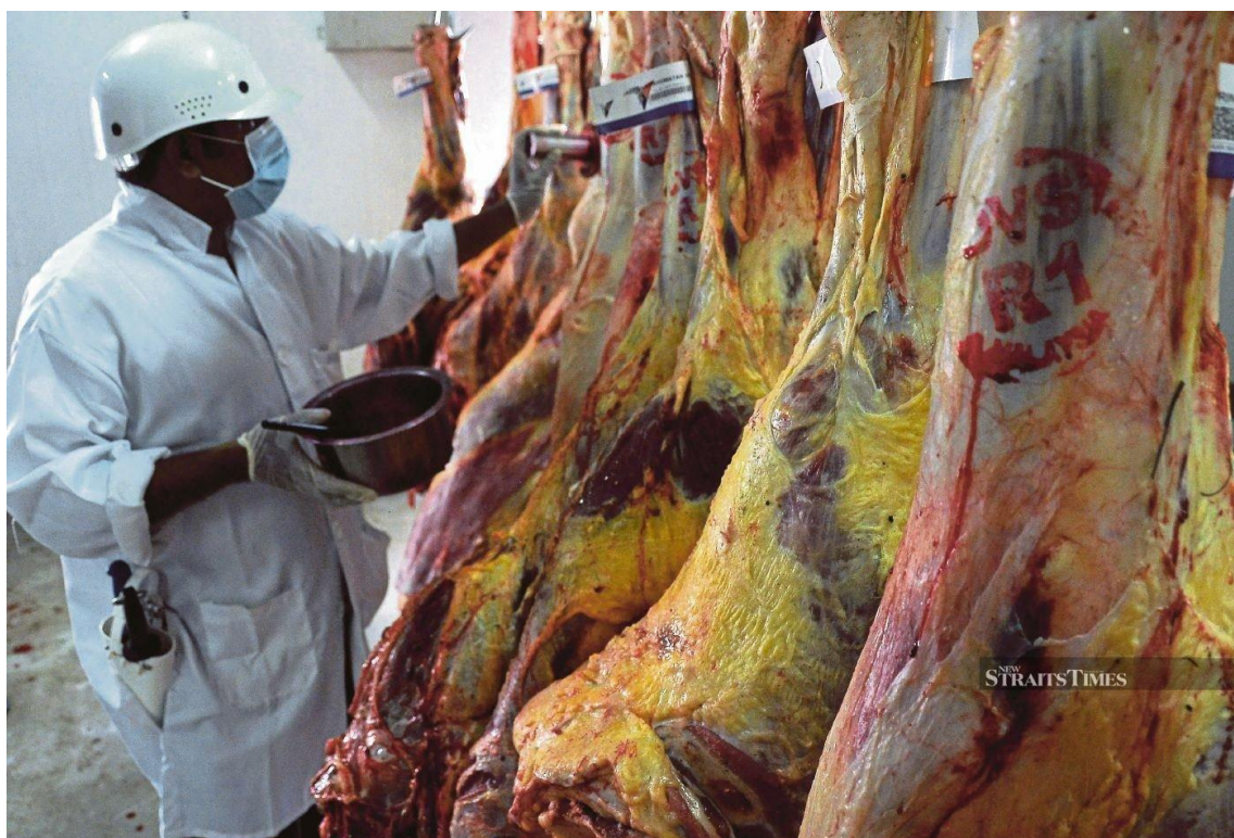
A Department of Veterinary Services inspector at an abattoir in Shah Alam. DVS wants to increase the number of meat inspectors to ensure that livestock are safe for slaughter.

KUALA LUMPUR: The Department of Veterinary Services (DVS) will increase the number of meat inspectors nationwide as it seeks a four-star rating in an audit under Australia's Exporter Supply Chain Assurance System (ESCAS) scheduled for June.